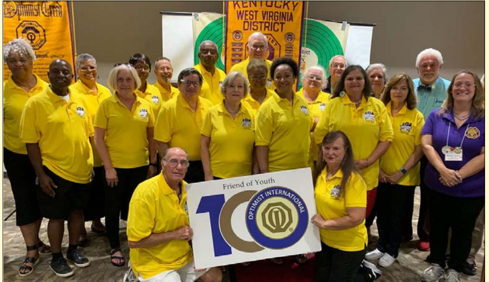
KYWV Host District volunteers for the International Convention pose for a photograph during our District Convention.

Also, special thanks to the Optimist Club of Louisville, one of the original