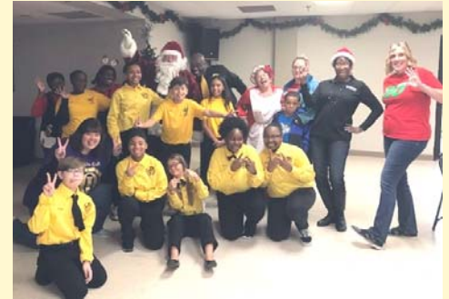
The Optimist Club of Radcliff and North Middle School JLC members strike a funny pose with Santa and Mrs. Claus after working the 1st Annual Optimist Club Breakfast with Santa at Colvin Community Center.

After reciting "Promise Yourself", Optimists wished each other and the President a Merry Christmas and Happy New Year.