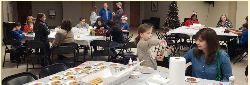
After eating a breakfast of pancakes and sausage with milk, juice, and hot coco with marshmallows, attendees were able to make Christmas Cards, holiday noise makers, decorative cookies, and sticker art.