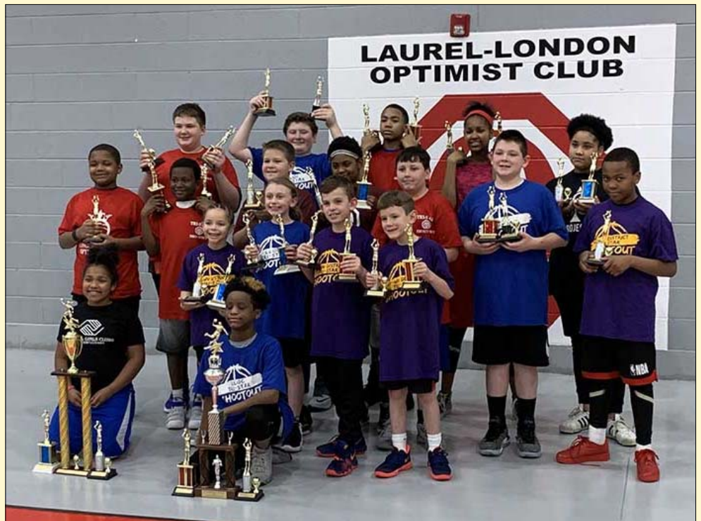
Everybody was a winner at District Tri-Star Contest