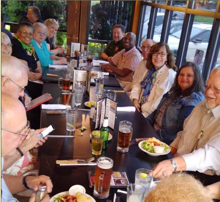
Friday evening was reserved for the District's usual "Dutch Treat" dining. The meeting, we went to Rafferty's Restaurant.