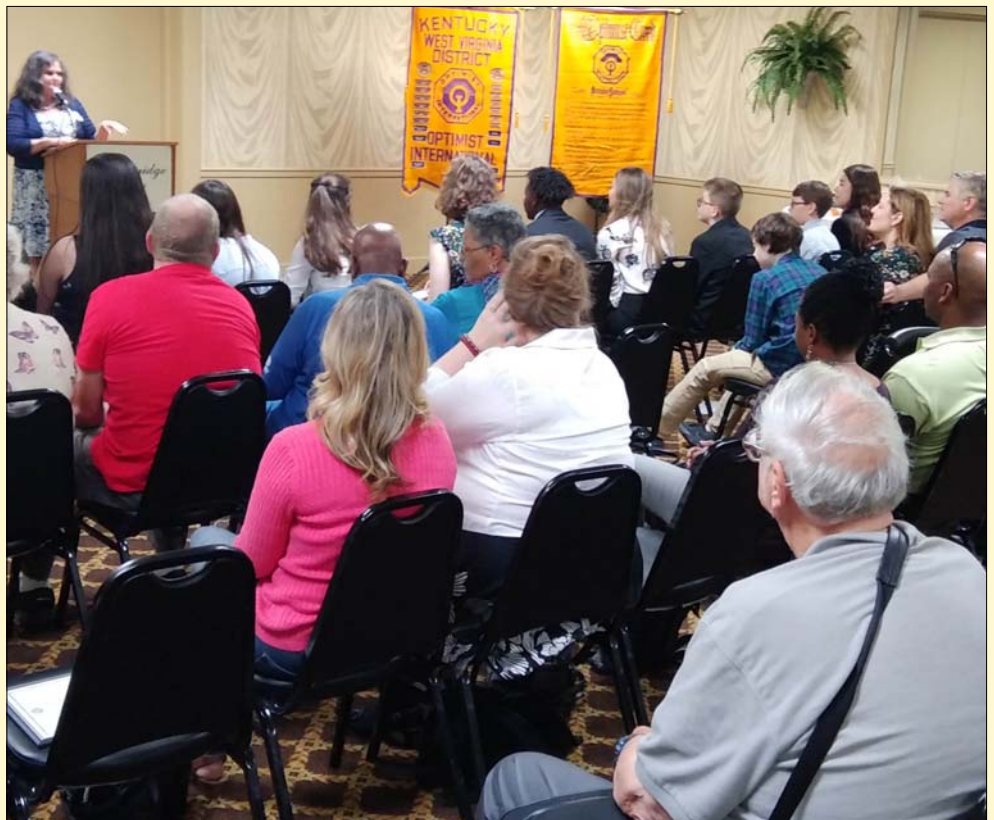
A large crowd of Optimists and guests were in attendance to hear this year's group of Oratorical contestants.