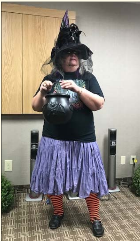
Madam Bombushka by governor-elect Beth Kerns.